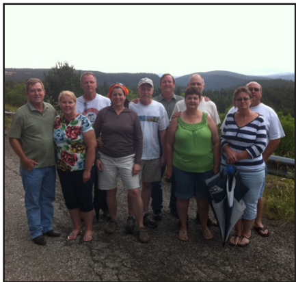
View from Mountain Pass outside Taos, NM