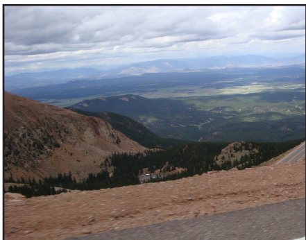
View from Pike's Peak (elev. 14,110 ft)