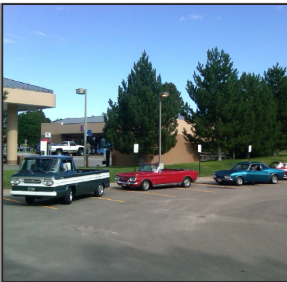
Denver Tech Center (Host hotel)