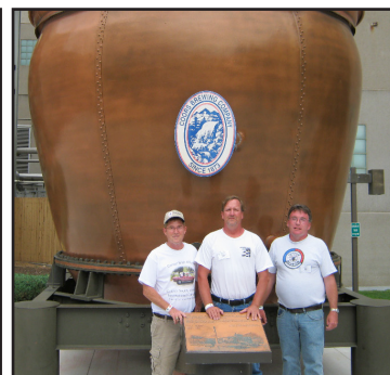
Tour of Coors Brewery