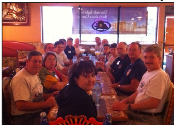
Dinner with the CH group on Wednesday night