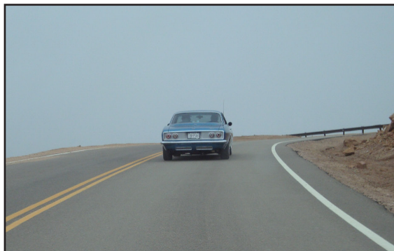
Ricki & Sally's '65 CORSA (view from Pike's Peak)