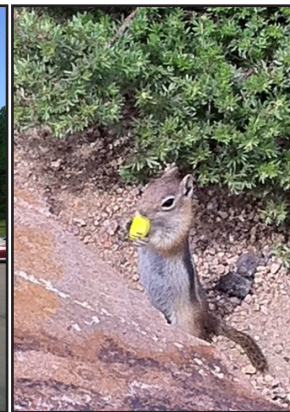
Wildlife Photo (Pike's Peak)